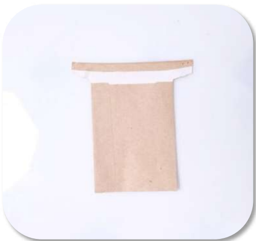
97 x 140mm Geo Sample packet S 1