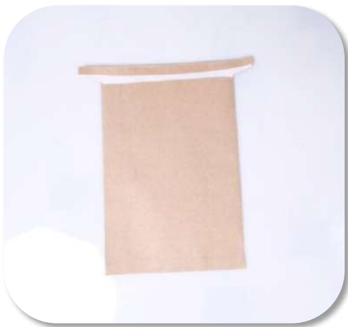
150 x 225mm Geo Sample packet L