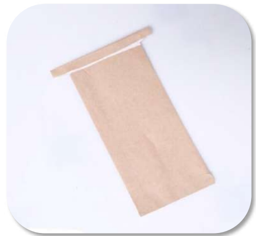
100 x 200mm Geo Sample packet B