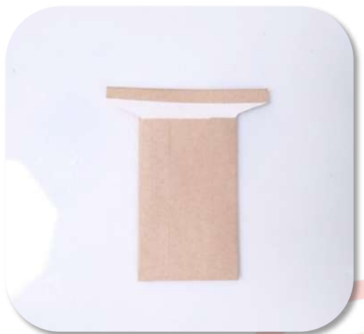
75 x 125mm Geo Sample packet S